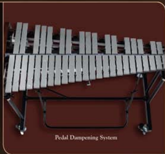
Pedal Dampening System